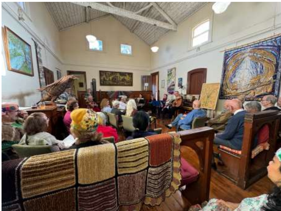
The audience enjoying the music amongst the Driven exhibition.