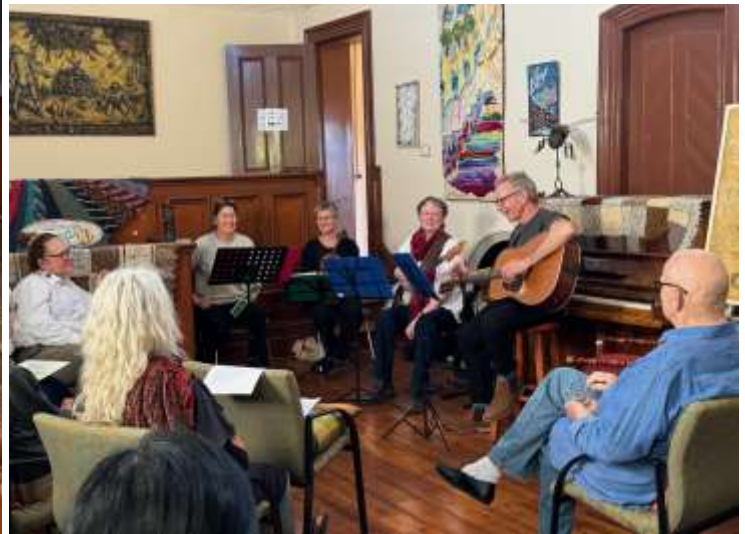
The Jeruk River Band.

The next exhibition on the calendar features photography featured in the last ten editions of the Charlton Cultural Magazine. The gallery is the co-sponsor of the magazine's photo competition. Many of these images, plus others that have been used in various stories, will be on display. The magazine has featured many artists and the exhibition will also have some of their creations on display.