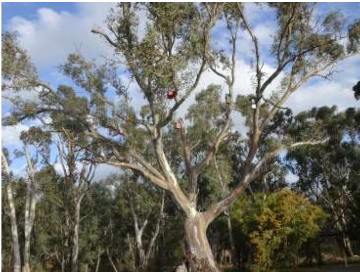
The High Rise Apartments in a Tree in Dews Lane near the Low Water Bridge.

Bird boxes have been installed in Donald, Wycheproof, Birchip, Culgoa, Berriwillock, and Sea Lake.