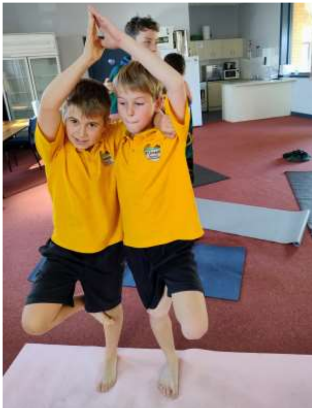
Below: Yoga – Whole Class.