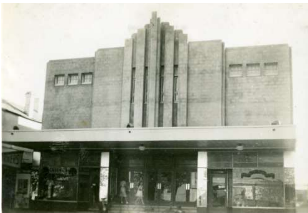
An early photo of The Rex Theatre.