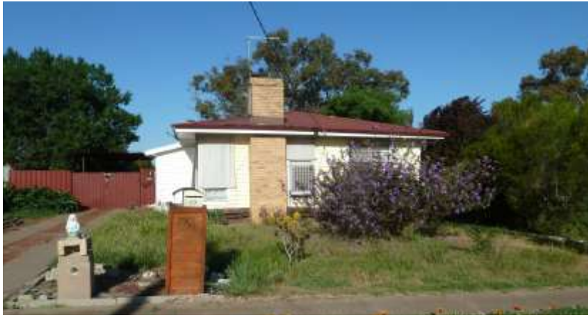
GREAT RENOVATOR, GREAT LOCATION - MOVE STRAIGHT IN! This neat and well-presented three-bedroom home located high on the hill is a great first home or ideal reno.