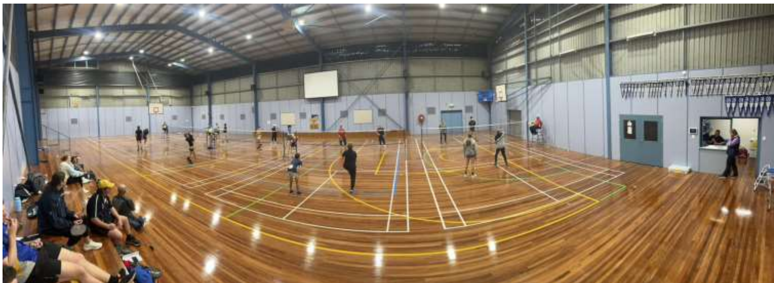
Wednesday Night Badminton.