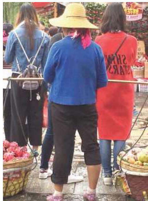
Old Dali Town.