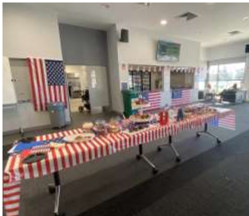
All decked out for the 4th July theme.