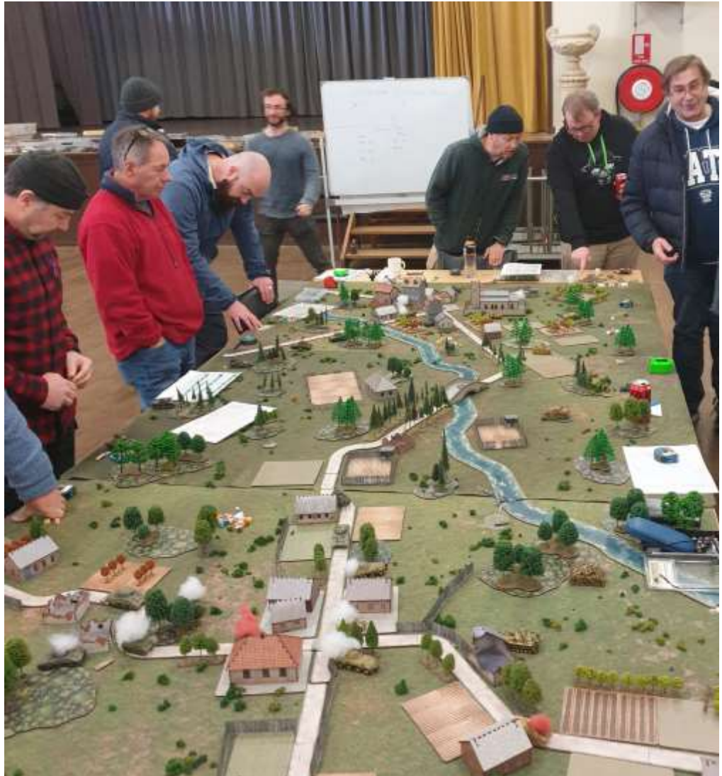
Players gathered around one of the tables.