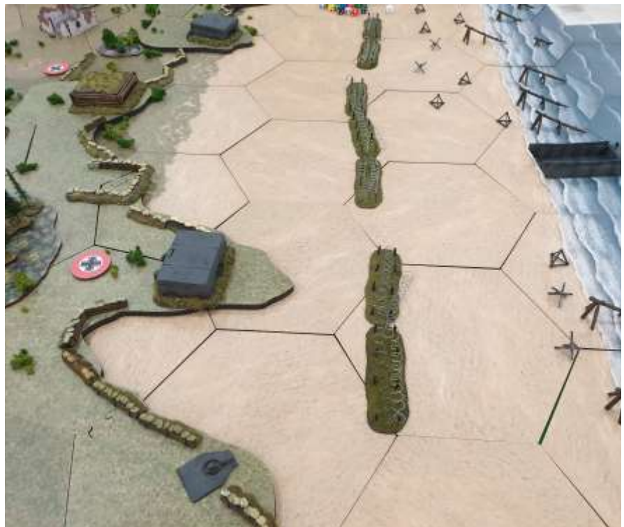
Details of game play—beach invasion.