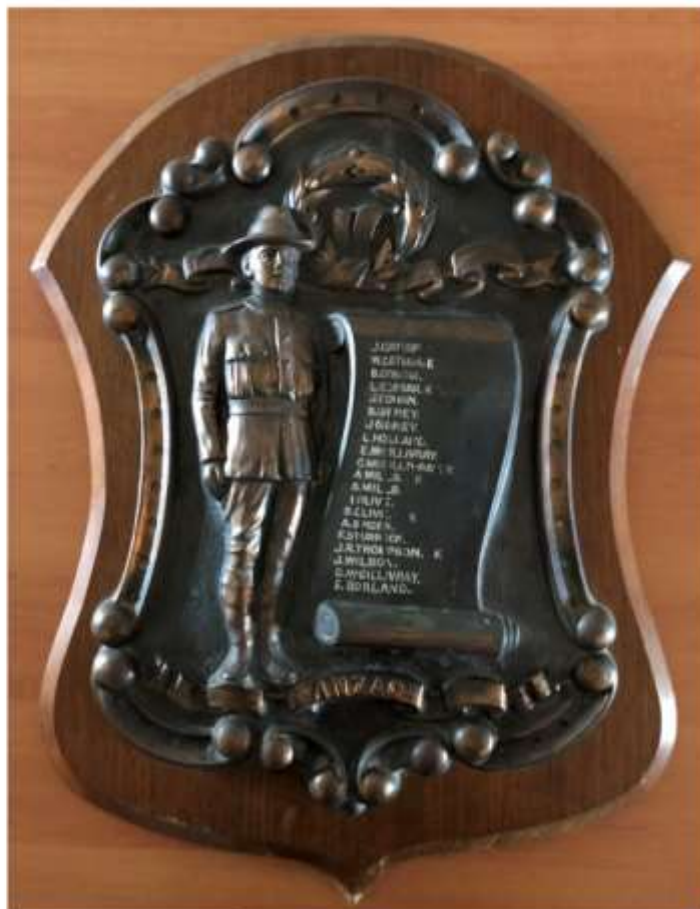
Above: The Yeungroon State School Honour Roll which now hangs on the wall at the Yeungroon Fire Station.