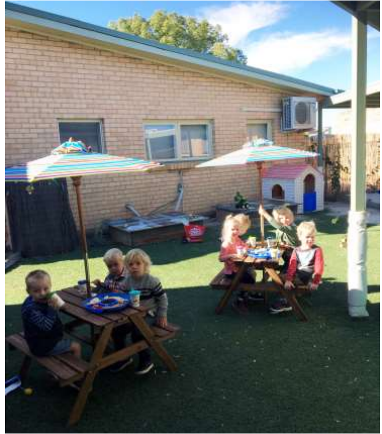
Above: The children enjoying Charlton Playgroup's newest purchase from the money raised at the recent Girls Night Out Fundraiser.

The Playgroup 'Op Shop' has recently undergone a tidy and sort. When you attend Playgroup or the Health Centre please feel free to venture into the back room and see if there may be any clothing suitable for your children. Clothes are sorted in size from babies through to size 6 (boys & girls). There are also lots of shoes. New clothing is constantly coming in when our kids outgrow it, so please check regularly.