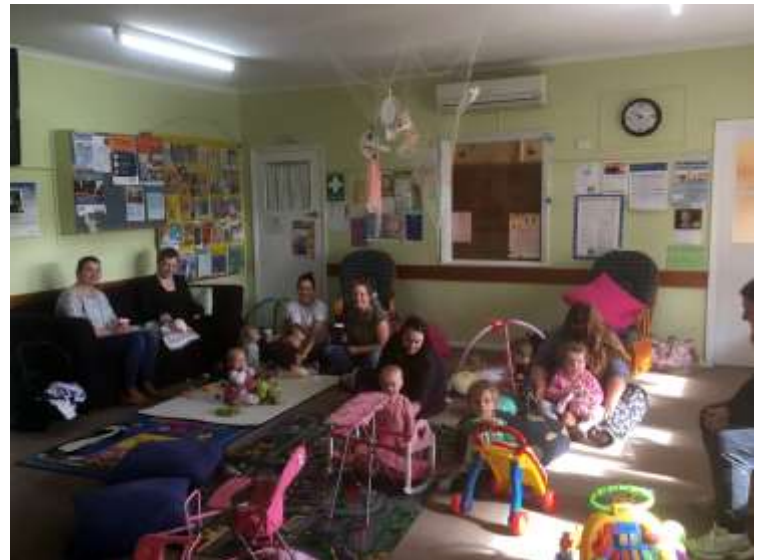
Above: A group of mums and their children at playgroup on the first day of this term. Wonderful to see new babies and children attend playgroup each week!!

WALSH MOTORS 5491 1444 www.walshmotors.com.au