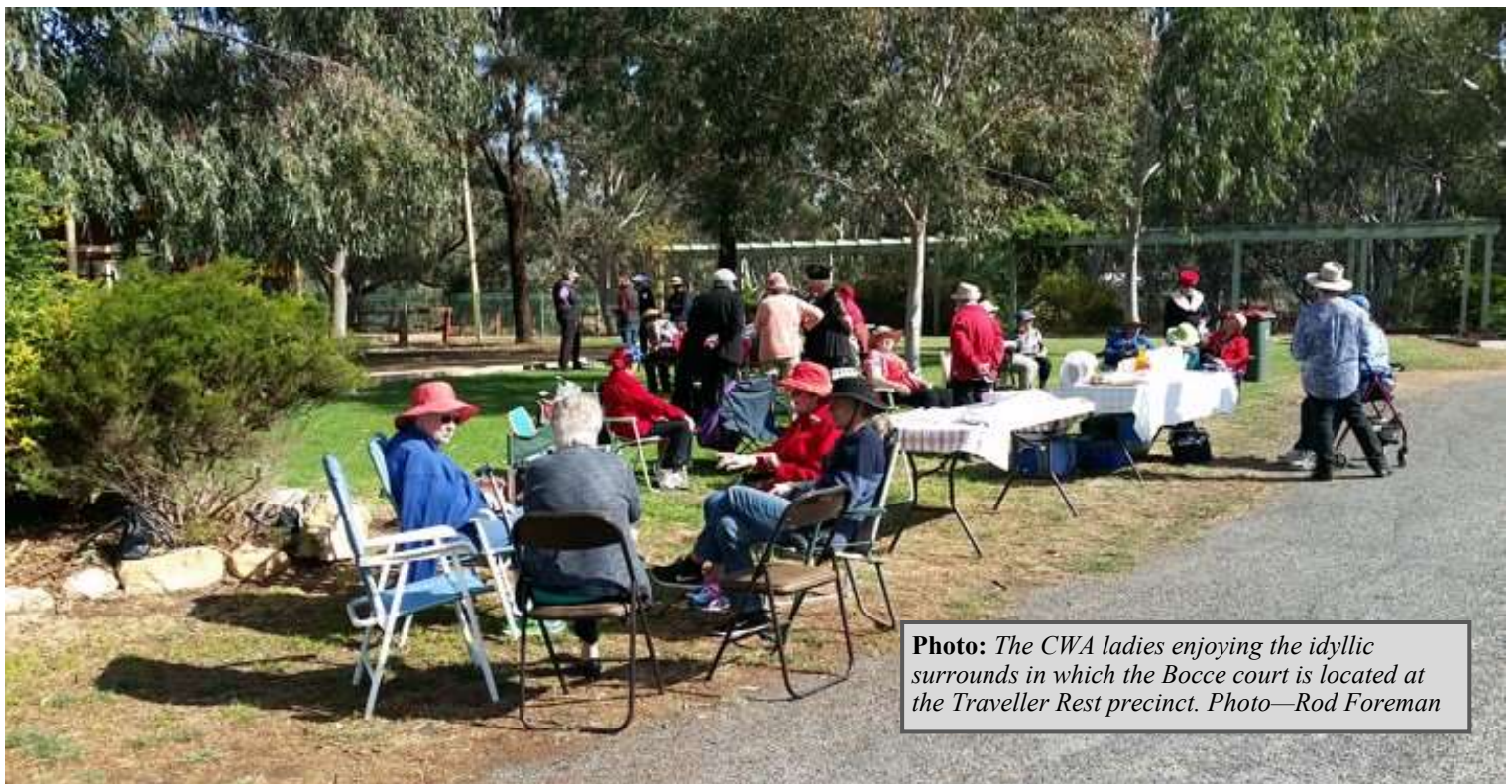
Photo: The CWA ladies enjoying the idyllic surrounds in which the Bocce court is located at the Traveller Rest precinct.