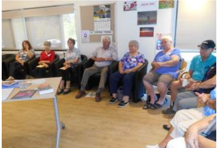
Above: Attendees at the information session.