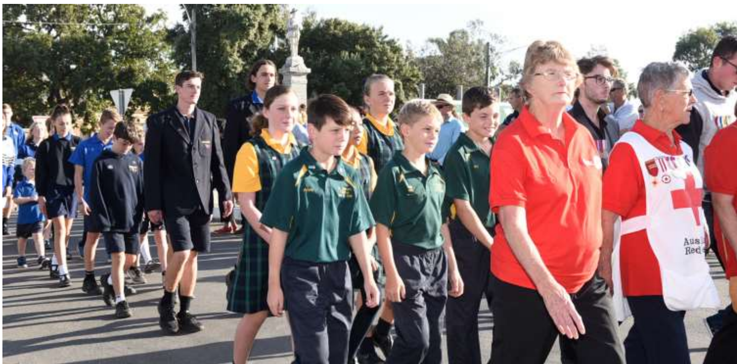
Above: The Charlton march was supplemented by a large contingent of students from Charlton P12 College, St. Joseph's Primary School, as well as organisations such as the Friends of Red Cross (pictured at the right of the photo).

And while ANZAC Day is not about the glorification of war – it is a reminder that "as we watch the parade, or see the