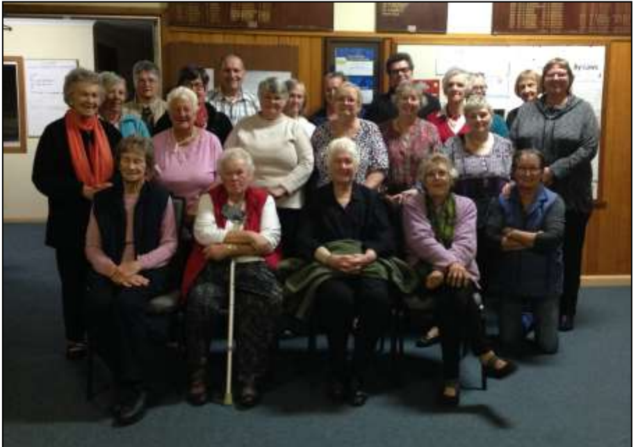
Above: The group who travelled to Donald for Bingo in April.

On Thursday 26 th April the Prep & Grade 1s from Charlton