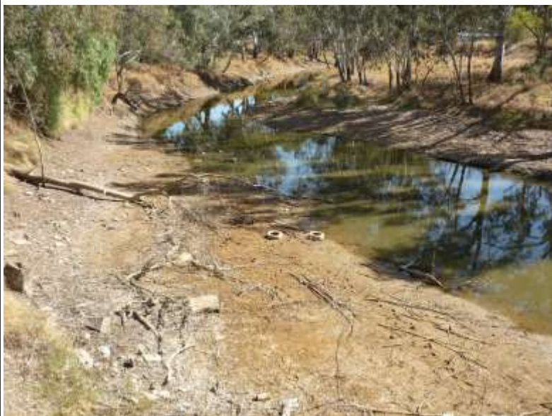
Above: View of the Avoca River in Charlton at the moment.