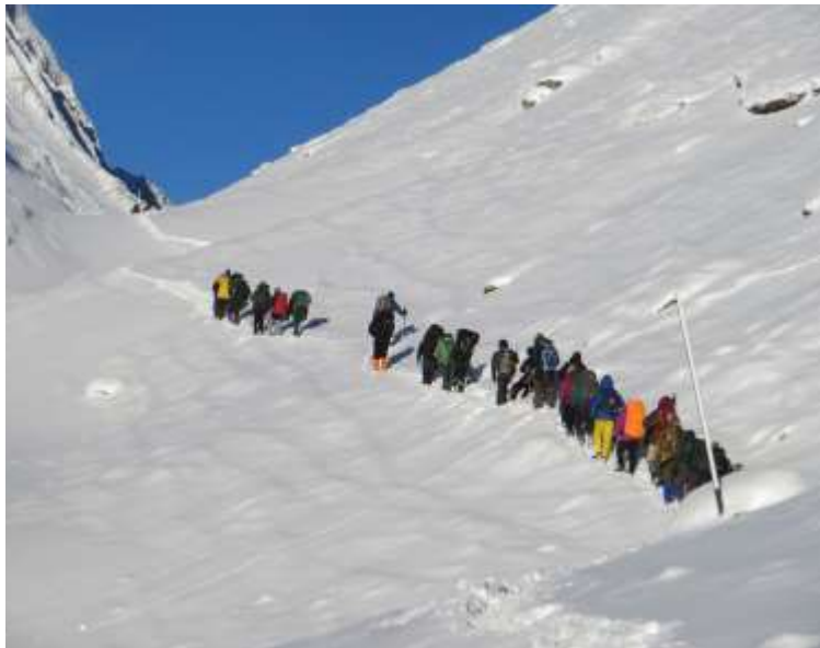
Above: Crossing Larke Pass (5160 meters). They trekked 25 km that day mainly through fresh snow up to half a meter deep.

He captured the colour of this culture and the people, and some dramatic views of the mountains, from a dazzling yellow sunrise to the snow white peaks against a vivid blue sky, and a frozen waterfall. He also captured small moments of children and birds and shrines and women squatting as they napped, or crushed the stones. Trevor gave a colourful account of a country and culture we knew little about.